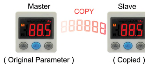
( Original Parameter )